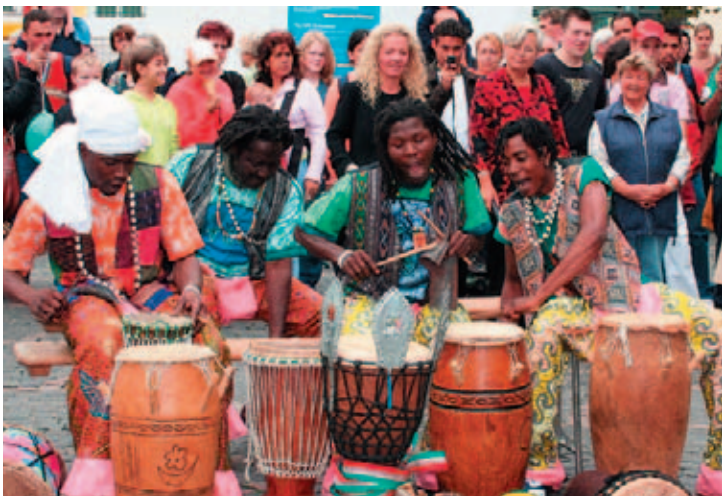
The World Youth Day