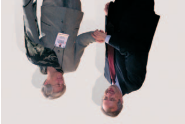
UN Millennium Campaign Executive Coordinator, Eveline Herfkens meets with The Mayor of Rome, Walter Veltroni, who is also President of the UCLG's Working Group on the Millennium Development Goals.

In this brochure you can find information on how local authorities around the world can work to ensure that the Millennium Development Goals are achieved by 2015. To be more specific, in this half of the brochure you can find eight practical ways in which Southern local authorities can help to achieve the Goals. If you flip the brochure over there are also eight practical ways in which Northern local authorities can raise awareness and generate political pressure to ensure that the Millennium Development Goals are achieved.