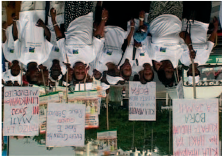
On 1 July 2005, to mark the first global day of action against poverty (White Band Day I), the Tanzanian anti-poverty coalition organized several events against poverty, including a march – involving hundreds of citizens – demanding quality basic public social services for all.