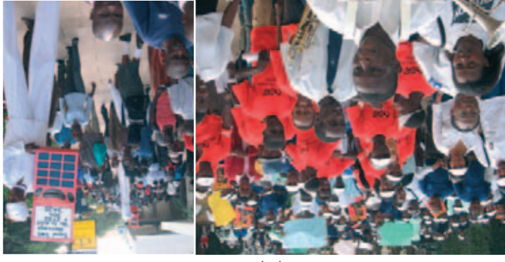
On 10 December 2005, to mark the third global day of action against poverty (White Band Day 3), the Kenyan anti-poverty coalition launched a "Caravan of hope in solidarity with the poor" which marched through seven informal settlements in Nairobi. The coalition – which included public service unions and youth networks – also organised events to entertain and educate people on poverty issues. The Caravan and related events reached out and educated an estimated 50,000 people.

UN-Habitat's "Participatory Budgeting Toolkit" and "Frequently Asked Questions on Participatory Budgeting" provide further information on participatory budgeting.