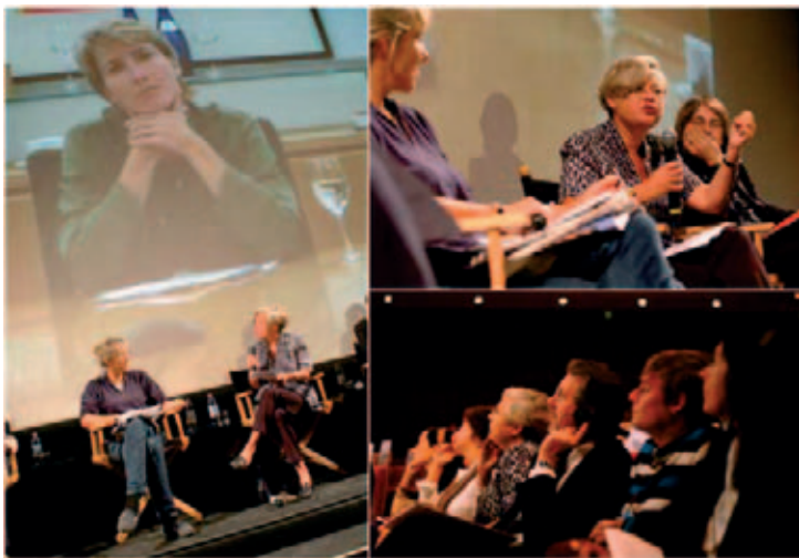
The Milan Film Festival, Italy