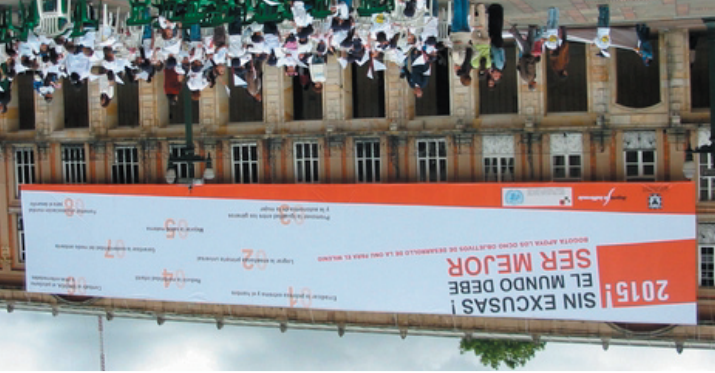
In September 2005, as part of the UCLG "Millennium Towns and Cities Campaign," the city of Bogotá hung a large white banner in support of the Millennium Goals with the slogan "2015: No Excuses! The world must be a better place."

To start with, a round of neighbourhood-level meetings were held in each city district, during which citizens could propose projects and works for public funding. During these meetings, citizens also elected representatives to join "District Participation Councils." These Councils – each covering a different theme or sector – worked with municipal technical teams to develop citizens' ideas into fully-fledged project proposals. A second round of consultation was then organised consisting of a single meeting in each district. During these meetings, fully-developed project proposals based on citizens' original ideas - the joint work of the District Participation Councils and municipal teams – were presented to citizens in a "project fair". Based on the detailed project information presented at the fair, residents chose projects for implementation in their district.